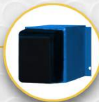
Bump Block & Molded Cord Rubber